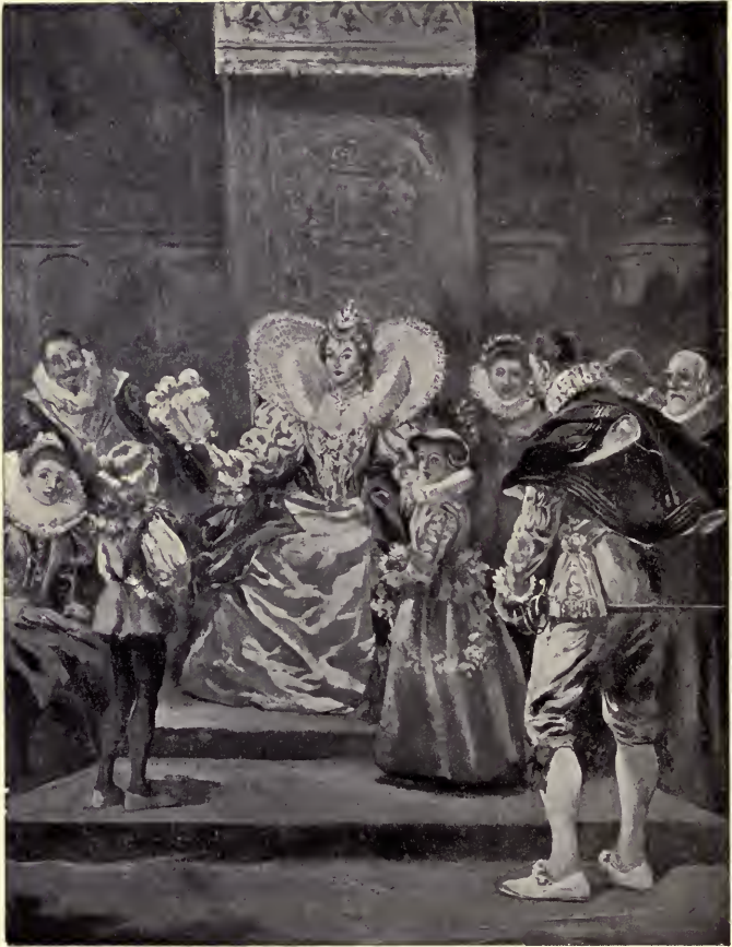
“Master Skylark, thou shalt have thy wish,” said Queen Elizabeth.